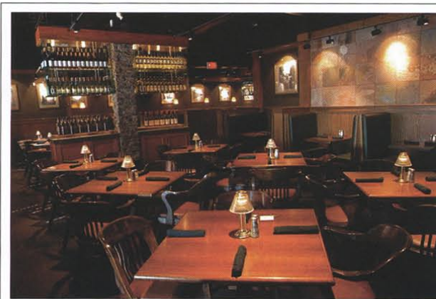
The re-designed dining room with butcher block tables and glass wine cabinets.

In its literature, SIR Corp defines Canyon Creek as "a casual yet elegant dining experience ideal for lunch, dinner or late night dining."